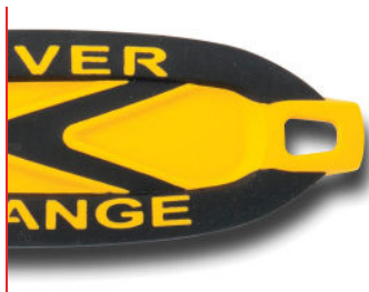
Innovative Plastic Tape Splitter Available in the yellow handle ONLY.