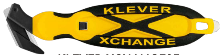
KLEVER XCHANGE35 CONCEALED SAFETY CUTTER