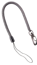
A42001-9 Clip-on Coil Lanyard