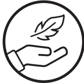
lightweight and compact