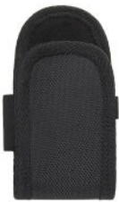
A41014-7 Universal Safety Knife Fabric Holster