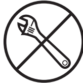
easy, no-tool blade change