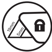
2 locked cutting depth options