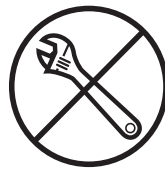
easy, no-tool blade change